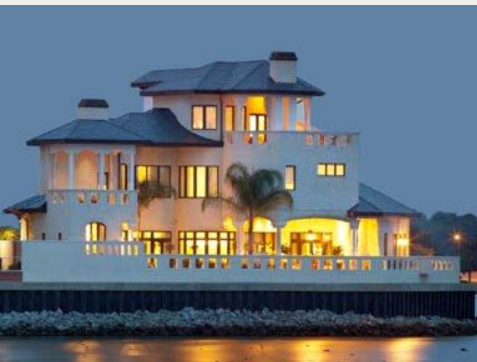
Levin Residence—Pensacola, Florida