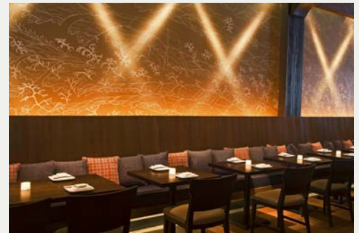
Makoto Restaurant—Bal Harbour, Florida