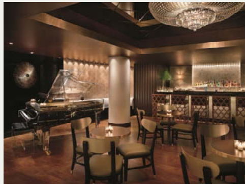
Florida Room at the Delano—Miami Beach, Florida