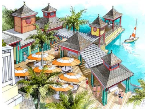
Beaches Boscobel—Ocho Rios, Jamaica