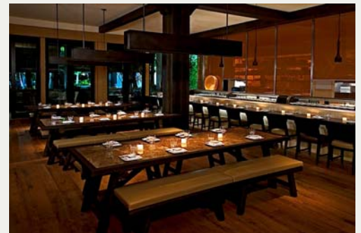
Makoto Restaurant—Bal Harbour, Florida