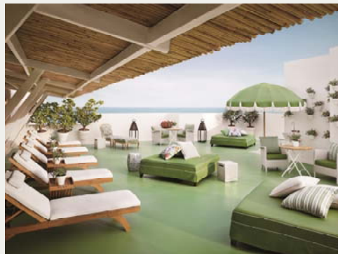
Agua Spa at the Delano—Miami Beach, Florida

Delano , the trendy South Miami Beach hotel owned and operated by Morgan's Hotel Group has been under several levels of renovation during the past four years. Adache Group has collaborated and supervised the renovation of the various phases including the guest rooms and corridors, The Florida Room, The Agua Spa, Rooftop Solarium, The Blue Door Restaurant and the new Rose Bar. Morgan's Hotel Group is a hospitality company that owns or partially owns and operates twelve boutique hotels comprising over 3,000 rooms.