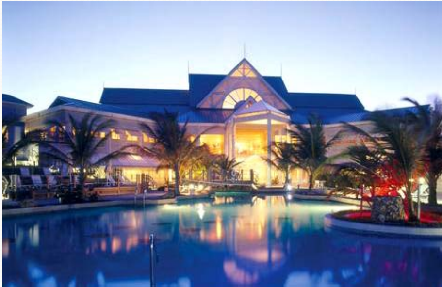
Magdalena Grand Beach Resort—Tobago

Adache Perspective is a periodic corporate newsletter published by Adache Group Architects to inform their clients, prospective clients, and friends of their current architectural and interior design projects.