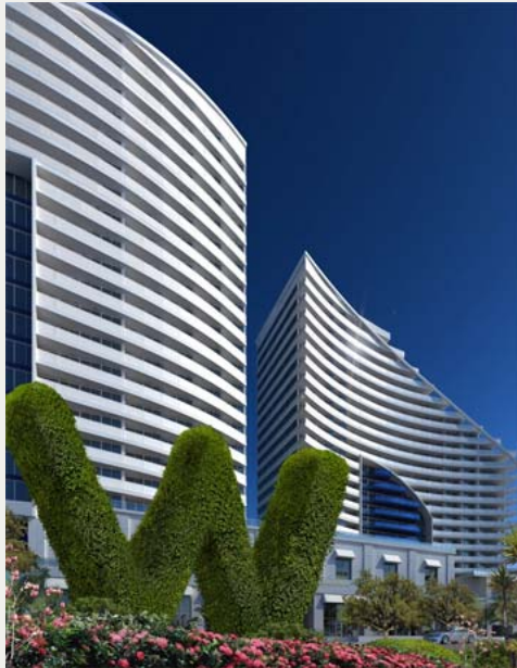
W Resort & Residences —Fort Lauderdale, Florida

Also, currently under construction on the small island of Staniel Cay, Exuma, in the Bahamas, is a 16,000 sq. ft., $10 Million Dollar Adache designed island resort estate complex which is known as The Staniel Cay Residence.