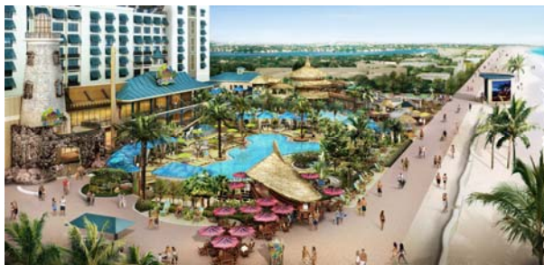
Margaritaville Resort—Hollywood Beach, Florida

Adache Group and their team of Consultants continue to advance in the construction documents on the Margaritaville Resort , a 348-room hotel and beachside entertainment facility on Hollywood Beach, Florida in hopes for a building permit and construction commencement in January of 2012. Developed by Lojeta Group, LLC , in conjunction with the branding by the Jimmy Buffett Organization , the resort will be managed by Coral Hospitality . Located on an entire city block, the 6.7 acre beachside resort will also include beachside entertainment, a destination spa, convention and meeting facilities, band shell, parking structure for 1056 cars, and five food and beverage restaurants, including the famous Margaritaville Restaurant , 12 volt Bar , and the 5 O'clock Somewhere Bar . The Margaritaville Hollywood will be Buffett's second resort hotel facility and will join their family of 17 existing Margaritaville Cafes in the US, Caribbean and Hawaii.