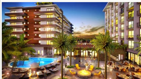
Marriott Resort—Pompano Beach, FL

Urgo Hotels LP of Bethesda, Maryland has retained Adache Group to provide the full service of architecture, engineering and interior design for the 219-room oceanfront Marriott Hotel (formerly Ocean Point) in Pompano Beach, Florida. The twin tower facility consists of a complete renovation of a 100-room existing tower and a new tower of 119-rooms. Founded in 1980, Urgo Hotels is a family owned and managed group with about 20 upscale hotels with over 3,400 rooms. Urgo Hotels has chosen to joint venture with the Carlyle Group , a well known American-based global asset management firm specializing in private equity. The property is slated to start construction in early 2012 and open for business as a full service Marriott Resort in 2013.