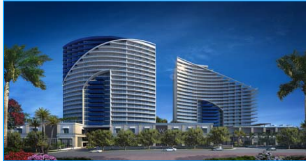
'W' FT. LAUDERDALE RESORT & RESIDENCES

The right combination of architecture design, planning and interior design capabilities keeps our company in the forefront of the industry we represent.